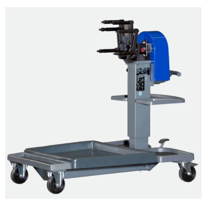
Figure 2- Motor and gearbox holder VAS 6095